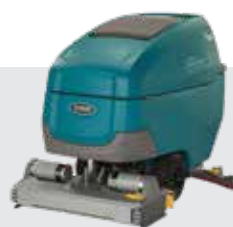
Cylindrical: 28 in / 700 mm & 32 in / 800 mm

The T600 scrubbers have multiple machine head types to fit your cleaning applications and optimize cleaning performance for specific areas.