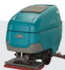
Orbital: 28 in / 700 mm