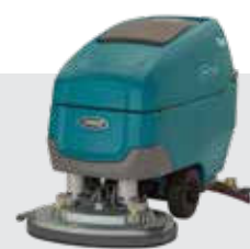
Dual disk: 28 in / 700 mm & 32 in / 800 mm & 36 in / 900 mm