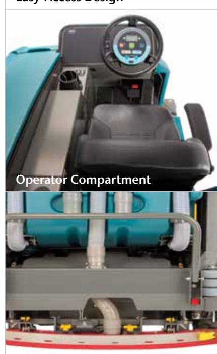
Yellow Maintenance Touch Points